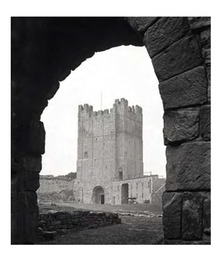
Figure 1 Richmond castle, North Yorkshire. The Great Tower, over 30 metres high, was begun by Earl Conan before 1171 and completed by Henry II.

The heart of nearly any castle of the 11th to 13th centuries was the Great Tower (or 'donjon', often referred to in modern literature as the 'keep'). Usually square or rectangular in plan, though sometimes polygonal or round, this was the principal 'symbol of lordship', physically dominating its surroundings by its height, bulk and architectural brutalism (Figure 1). It would usually contain, on an upper floor, a presence chamber where the lord would sit to receive petitioners and dispense justice. The residence of the lord and his family might be here but would usually be supplemented by accommodation in other towers or buildings in the castle, usually comprising a hall and private chambers.