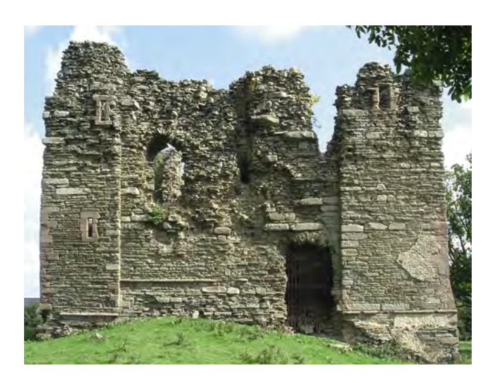
Figure 5 Hopton, Shropshire: a small castle with a late 13th or early 14th century tower built in imitation of a Norman Great Tower.

The castle retained its importance into the late medieval period, as a seat of lordship and political power base. New castles were built, often on an elaborate quadrangular plan and on a grand scale, as at Bodiam (East Sussex; Figure 4) and Bolton Castle (North Yorkshire). These castles had the symbols of military power – curtain walls, moats, and towers with arrow loops – but military needs were often sacrificed to the demands of more comfortable living, with large windows, and thinner walls allowing larger rooms. It could