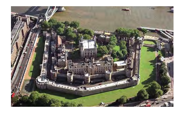
Figure 3 A concentric castle, the Tower of London.

Towards the end of the 13th century and for much of the 14th, the Great Tower declined in status and few new ones were built. Instead 'enclosure' castles with no dominant tower were built. The most sophisticated of these were 'concentric' castles, with the emphasis on closely-spaced double lines of curtain walls, where bowmen on the inner wall and its towers could cover defenders on the lower outer wall (Figure 3). This defence in depth was very effective, though no castle was ever impregnable to a really determined attacker.