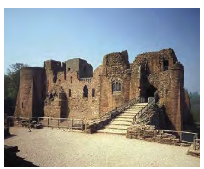
Figure 6 Goodrich Castle, Herefordshire. View from the barbican with the gatehouse, containing chapel and constable's quarters, in the foreground.

From the late 14th century onwards there was a revival of the Great Tower, with many elaborate new examples, such as Old Wardour (Wiltshire) or Tattershall (Lincolnshire) being built. Though these often contained deliberately old-fashioned elements, harking back to the glories of a heroic past, they were designed for comfortable living and grand entertaining rather than for military purposes (Figure 6). At Ashby de la Zouch (Leicestershire), prominent castellated elements including a great tower were added to an earlier, apparently unfortified manorial complex. But increasingly, from the 15th century great lords abandoned military architectural elements altogether and built grand houses round extensive courtyards, like Haddon Hall (Derbyshire) and Dartington Hall (Devon).