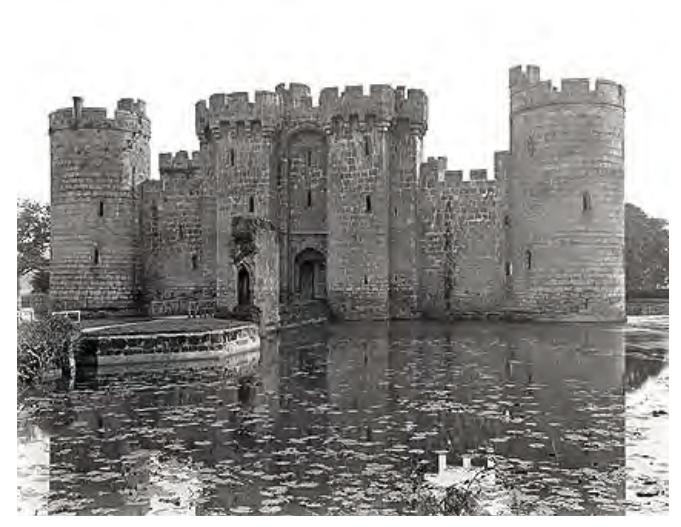
Figure 4 Bodiam, East Sussex. A small quadrangular castle of the later 14th century. How much this was intended as a defensible castle, rather than an old soldier's showhome, remains debated.

The castle retained its importance into the late medieval period, as a seat of lordship and political power base. New castles were built, often on an elaborate quadrangular plan and on a grand scale, as at Bodiam (East Sussex; Figure 4) and Bolton Castle (North Yorkshire). These castles had the symbols of military power – curtain walls, moats, and towers with arrow loops – but military needs were often sacrificed to the demands of more comfortable living, with large windows, and thinner walls allowing larger rooms. It could