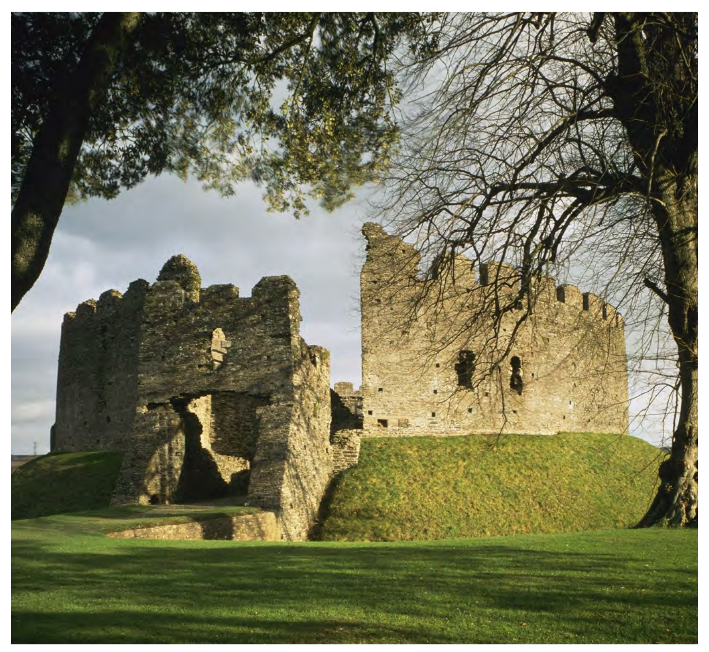
Figure 2 The late 13th century shell keep at Restormel Castle, Cornwall.

Towards the end of the 13th century and for much of the 14th, the Great Tower declined in status and few new ones were built. Instead 'enclosure' castles with no dominant tower were built. The most sophisticated of these were 'concentric' castles, with the emphasis on closely-spaced double lines of curtain walls, where bowmen on the inner wall and its towers could cover defenders on the lower outer wall (Figure 3). This defence in depth was very effective, though no castle was ever impregnable to a really determined attacker.