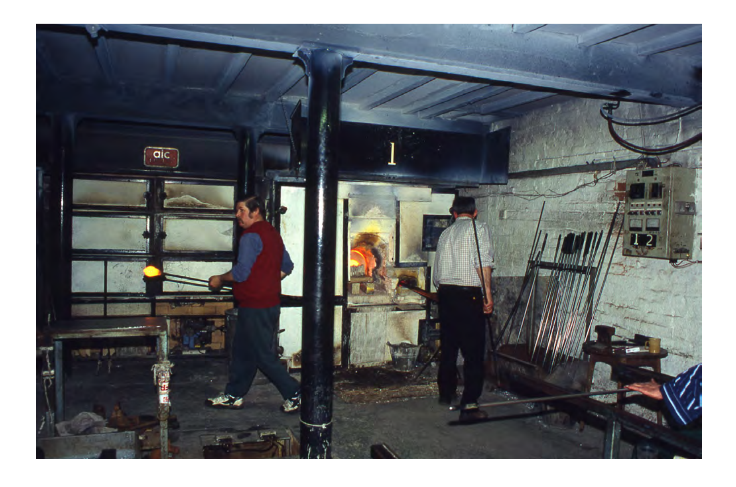
Figure 1 A modern glassblowers' workshop. The worker on the left is taking a 'gather' of glass to be blown on the metal mavering slab. Note the single 'glory hole' in the furnace (Georgian Crystal, Tutbury, Staffs, closed in December 2011).