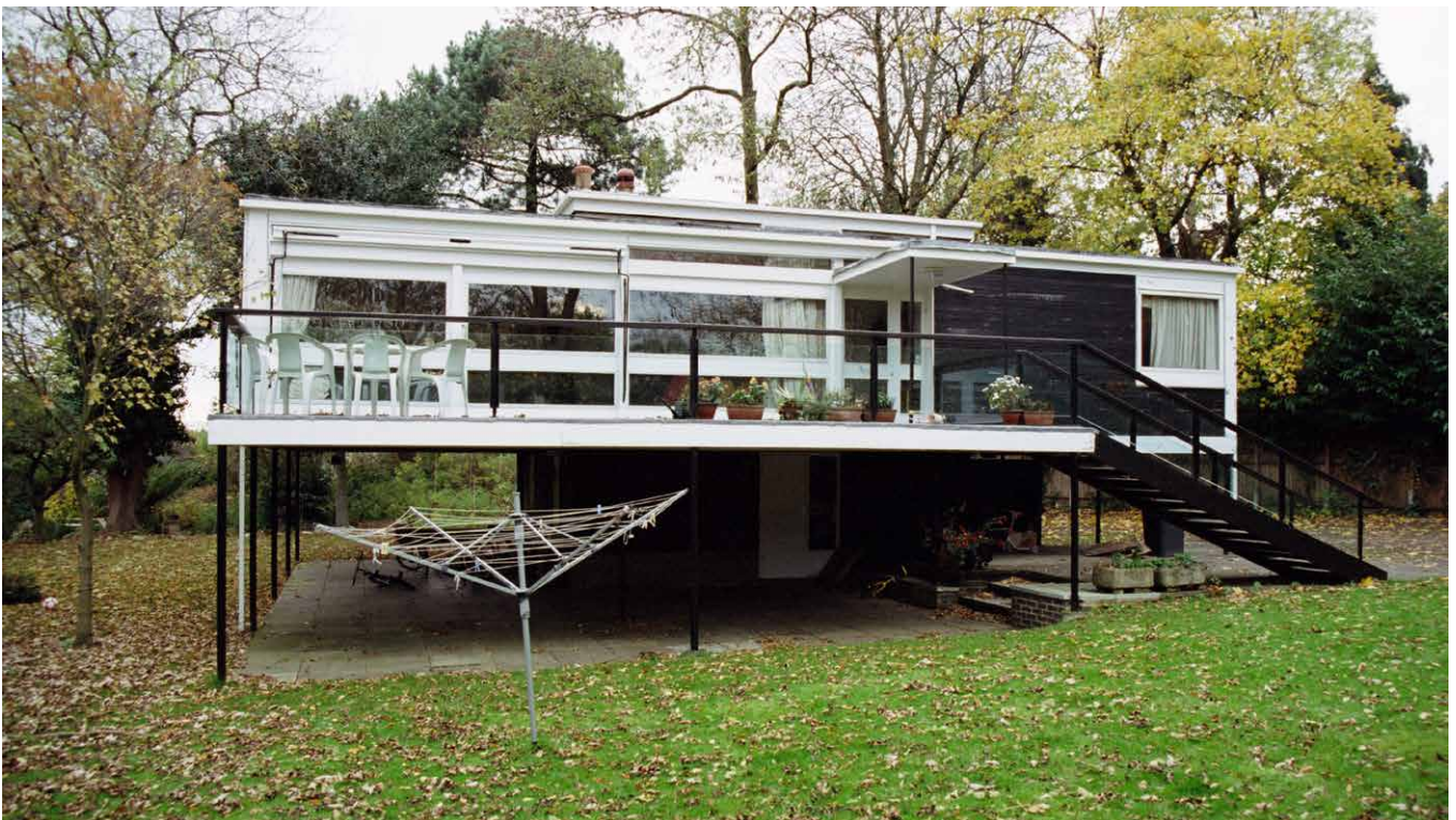
Figure 6 (top)

The Turn, Haddenham, Buckinghamshire, is a group of three houses by Peter Aldington constructed 1963-4. One, Turn End, is the architect's own house. A good example of the influence of vernacular architecture on modern housing. Listed Grade II*.