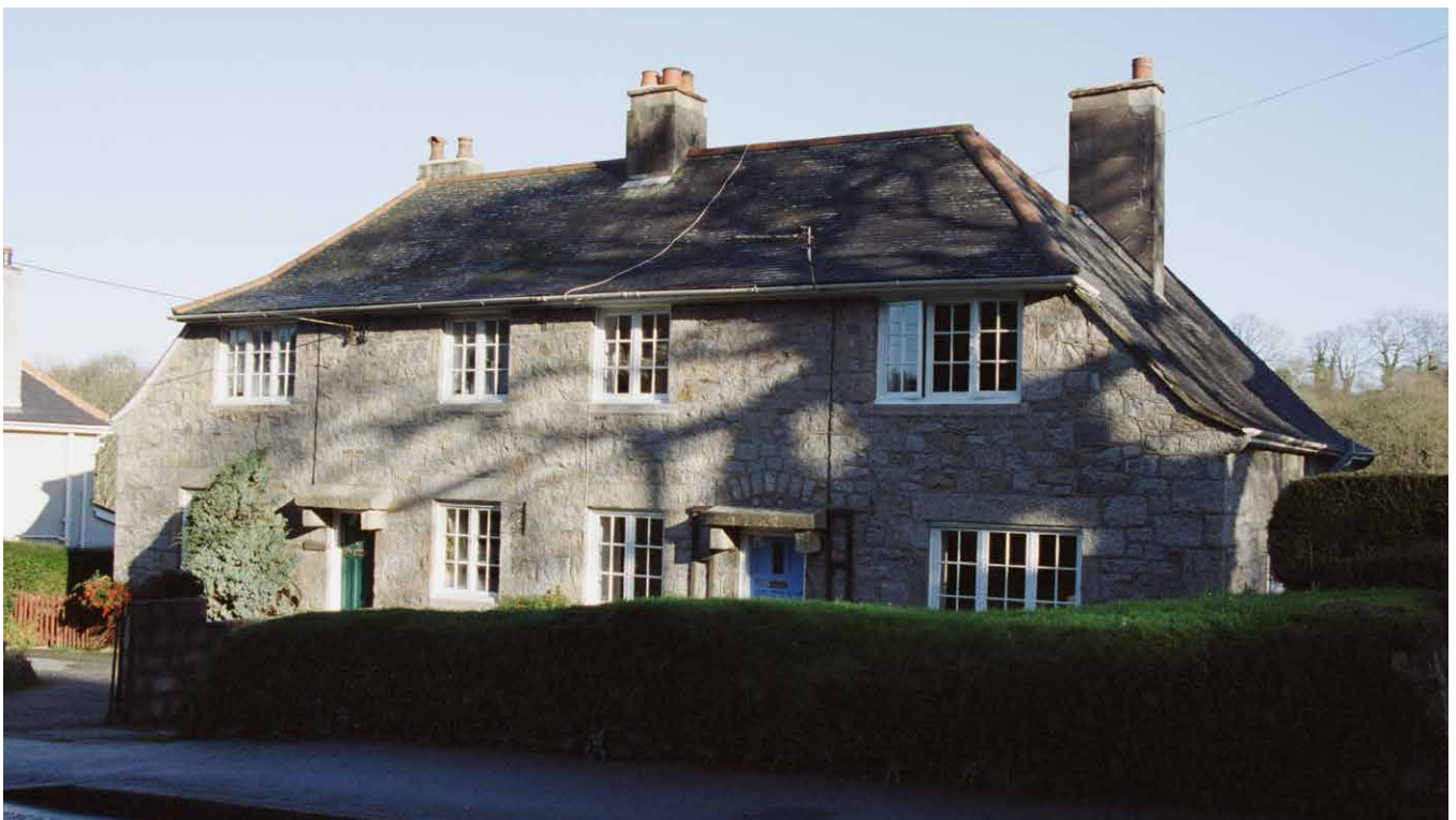
Figure 9 Council housing after the First World War, the result of the 'Homes fit for Heroes' campaign, set the standard for much that came after. This granite example in

In 1918 the Tudor Walters Committee recommended new standards for working-class housing, based on those of Letchworth (Unwin was on the committee) and the Local Government Board. It recommended building no more than 12 houses per acre, with three rooms per floor, plus a larder and bathroom. The standard informed the Housing Act of 1919, which finally made it mandatory for local authorities