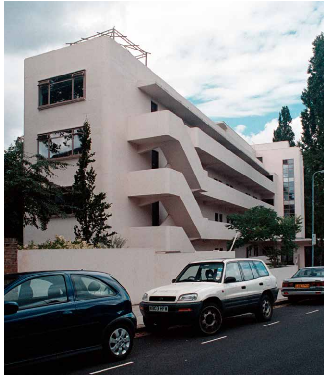
Figure 12 Lawn Road flats, Belsize Park, London Borough of Camden. Although with echoes of continental design, this block of 36 flats – designed to be 'minimum' flats for young (and mainly single) professional people – was in fact an extremely original design of 1929-34 by the architect Wells Coates. Listed Grade I.

Wartime housing The acute shortage of accommodation for farm workers, and the displacement of large numbers of evacuees, led to several rural programmes for low-cost homes actually during the war. Other programmes were a response not only to wartime bombing but to the shortages of accommodation already evident in 1939 and to subsequent internal migration. Churchill promised 'up to half a million' prefabricated houses in 1944: eventually 156,623 single-storey houses or 'prefabs' were built in eleven different styles but all based on a standard government design put out to tender. The resulting temporary bungalows employed a variety of asbestos, concrete, timber or aluminium panels (sometimes manufactured by aeroplane companies, switching from war to peace production). Shortages of materials and skilled labour resulted in the erection of many