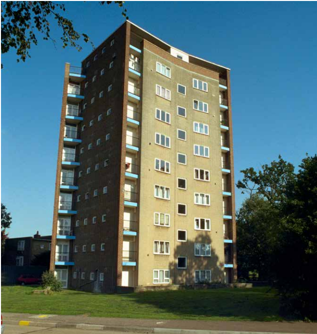
Figure 15 The first residential tower blocks in the country, The Lawn, Harlow (1950-1), designed by Frederick Gibberd, clads its ten-storey reinforced concrete frame with a warm red brick. Each floor has two one-bed flats and two bedsitters – all with balconies. Listed Grade II.