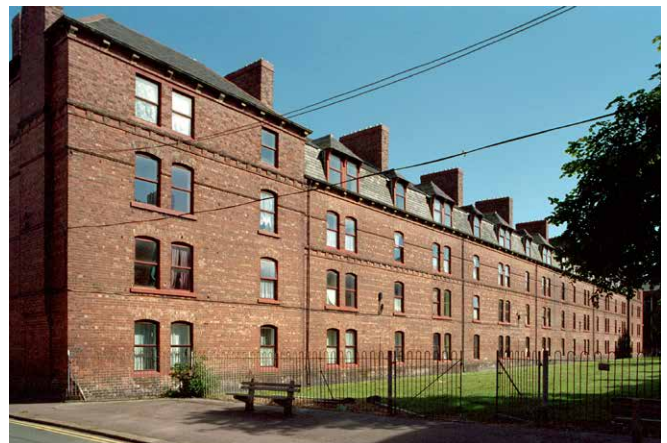
Figure 8 Baroque Street tenements, Barrow in Furness, Cumbria. Designed by Austin and Paley, this is one of a series of tenements built for Scottish workers in the dockyards of Barrow in 1884. An unusual example of a Scottish housing type transported into England. Only Newcastle-upon-Tyne has anything similar. Listed Grade II.

Some enlightened employers built housing for their workers: most spectacular are the tenements for the Barrow Iron Shipbuilding Company in Barrow-in-Furness, Cumbria (1881-4, Paley and Austin; mostly listed Grade II, some grander blocks II*; Fig 8); a more suburban pattern can be seen at the Bolsover and Creswell Colliery Company's