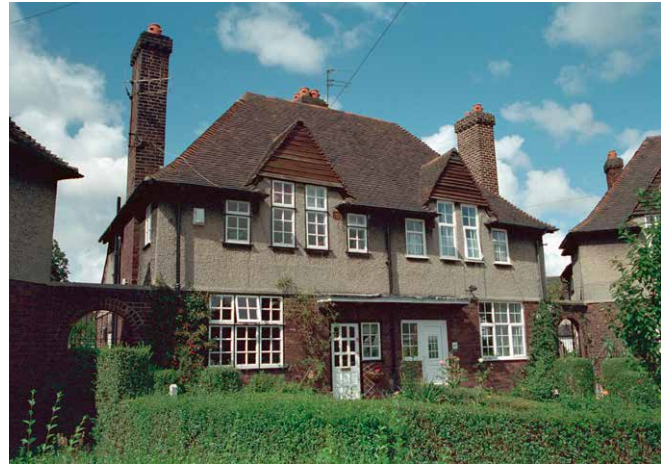
Figure 3 The semi-detached house, such as this example of 1913 in Wavertree Garden Suburb, Liverpool, designed by G L Sutcliffe, has come to characterise inter- and post-war suburbia and still provides the homes for many millions of people. Only very rarely are they of sufficient interest (as here) to merit listing. Listed Grade II.

continued the approach well into the inter-war period, though inflected by neo-Georgian influences, by which time some of the features of Arts and Crafts architecture had entered the vocabulary of the mainstream house-builder.