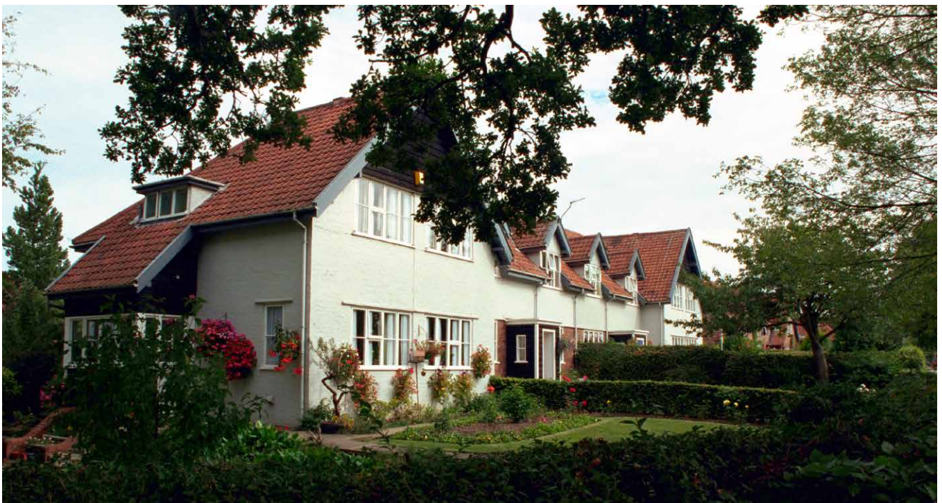
Figure 4 Built for the Rowntree's Cocoa Company in York from 1902, the New Earswick estate combined the Arts and Crafts approach to architecture with the emerging discipline of town planning to create good living