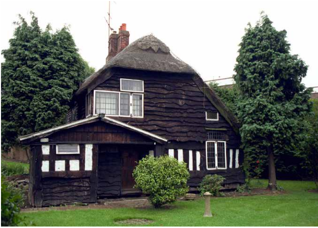
Figure 2 Idiosyncratic architects such as Blunden Shadbolt, Sydney Castle, and Ernest Trobridge developed a romantic individualism in the inter-war period, creating an idealised image of home. Here a traditional-looking house on Slough Lane, Kingsbury (London Borough of Brent), built in 1921 to designs by Trobridge, employed an innovative wooden construction system in an attempt to solve urgent post-war housing problems. Not all modern housing looks modern. Listed Grade II.