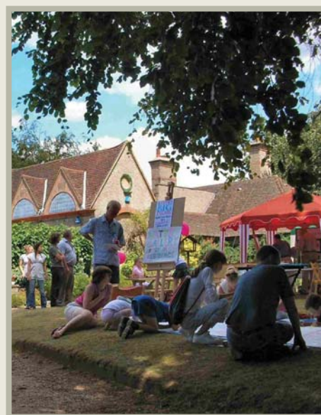
Image Engaging local communities in their heritage, Watts Gallery open day.

In 2008/09 HLF funding is down on previous years. In part this is because of the 2012 Olympics but is also due to legislative changes in the way that Lottery money is funded. The HLF has made awards of over £428 million to projects in the South East since 1994. However in 2008/09 the total sum awarded was just under £12 million. Whilst this figure represents a reduction of some 78% in the last year alone, some of this is due to changes in assessment procedures.