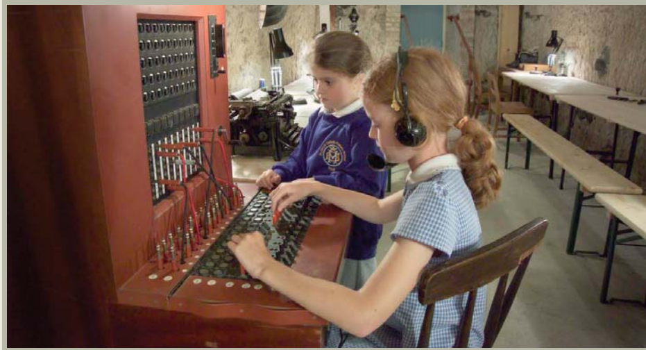
Image Children learning about the history of the secret wartime tunnels at Dover Castle.

Over the last year, the policy context in the South East has continued to evolve, including the implementation of new regional governance structures and process, such as the formulation of the new South East Cultural Partnership and the continued cross-sectoral efforts on place-making in growth areas. For the heritage sector itself, the publication of the draft Historic Environment Planning Policy Statement in July 2009 was a major milestone. For the historic environment