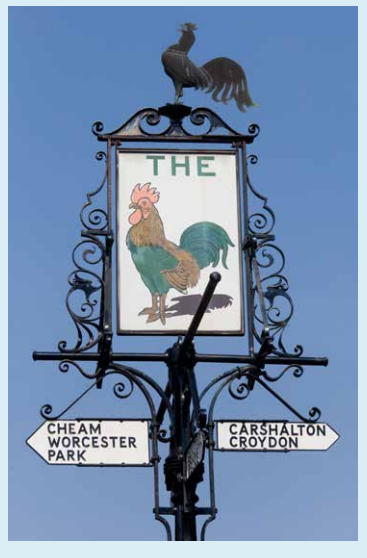
The Cock sign has stood at the top of Sutton Town Centre High Street since the 1930s, originally advertising The Cock Hotel.

Research commissioned for Heritage Counts 2017, to commemorate the 50th anniversary of conservation areas, employs a novel approach to analysing trends in conservation areas by benchmarking performance against matched non-conservation areas (OCSI et al , 2017). The research provides a comprehensive review of conservation areas nationally, using spatial data and national statistical indicators over time and particularly looked to understand trends in conservation areas in terms of 'good growth'. Head to the website for the full report .