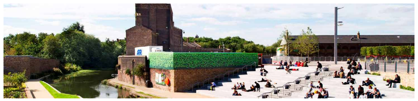
Image: King's Cross is an example of Good Growth, re-using heritage assets and respecting the character of the Conservation Area.