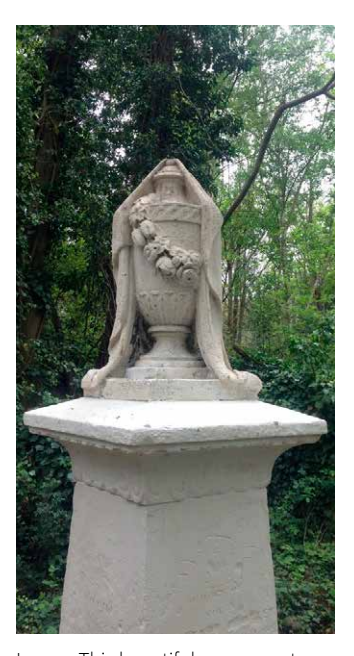
Image: This beautiful monument to Joanna Vassa at Abney Park Cemetery has been saved and removed from the Heritage at Risk Register.

42 sites have been removed from the Heritage at Risk Register this year. Despite these successes, London's historic environment is still vulnerable, with 45 sites added to the Register, including 12 conservation areas, particularly noteworthy in this 50th anniversary year. The addition of these conservation areas indicates the challenges these areas face in terms of accommodating growth in a positive and characterful way.