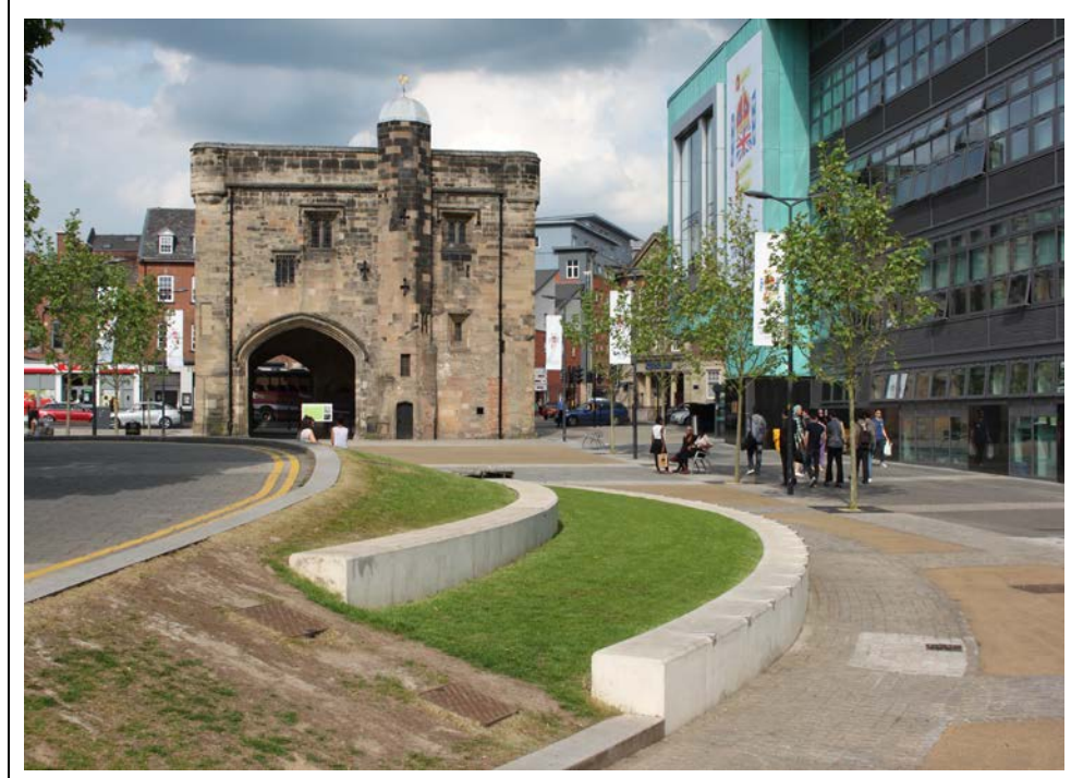
The Magazine Gateway in Leicester.

The Action Plan grew from a recognition that protection of this resource for the city's future requires more than the reactive tools provided by legislation. The Plan enables the Council to prioritise 'the most urgent and vulnerable assets, without losing sight of long-term issues, incremental loss of heritage or opportunities for major improvement projects'.