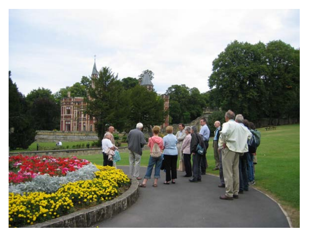
Saltwell Park on Heritage Open Days

Visit England's survey of Visits to Visitor Attractions suggests there was a 4% decrease in the numbers of visits to historic sites in the North East in 2010 compared with the previous year for properties answering the survey in both years. In total there were 2.47 million visits to historic attractions in the North East in 2010.