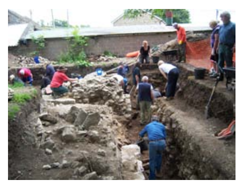
Altogether Archaeology Volunteers at Westgate Castle (directed by Archeological Services, Durham University)