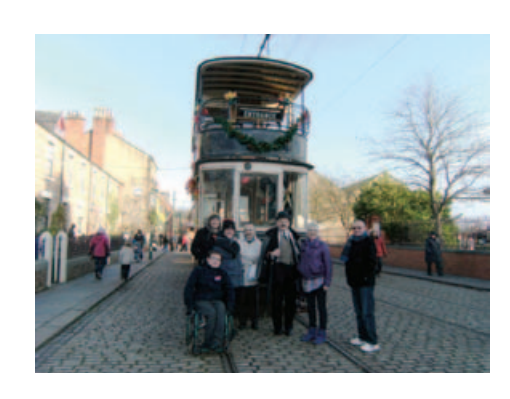
Volunteers on the Culture Track Programme

The project worked with 69 unemployed volunteers, each based at a local cultural venue. Of these, 67 received support to increase their employability, five completed basic skills qualifications, 14 completed NVQ level 2 qualifications, 19 secured employment and 27 moved onto further education, training or volunteering. 80% felt more ready for employment following their involvement with the project and many are still volunteering as part of Tyne & Wear Archives & Museums' volunteering programme.