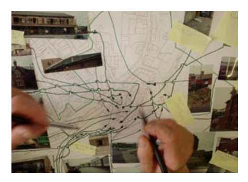
North Shields Fish Quay Neighbourhood Plan © North of England Civic Trust

Work is being led by the Fish Quay Heritage Partnership (comprising local residents, businesses and politicians) which will form the basis of a new Neighbourhood Plan group with support from the North of England Civic Trust. The project demonstrates how local people are being given the power to shape their areas and how local heritage groups can engage in this process.