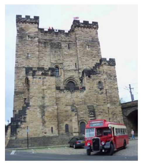
The Newcastle Vintage Bus Tour outside the Castle Keep on Heritage Open Days

Heritage Open Days (HODs) is the historic environment sector's flagship initiative for increasing participation. Held each September, HODs sees many historic venues open to the public which are normally closed, or admission fees waived. In 2010, the number of participating venues in the North East increased from 395 in 2009 to 402.