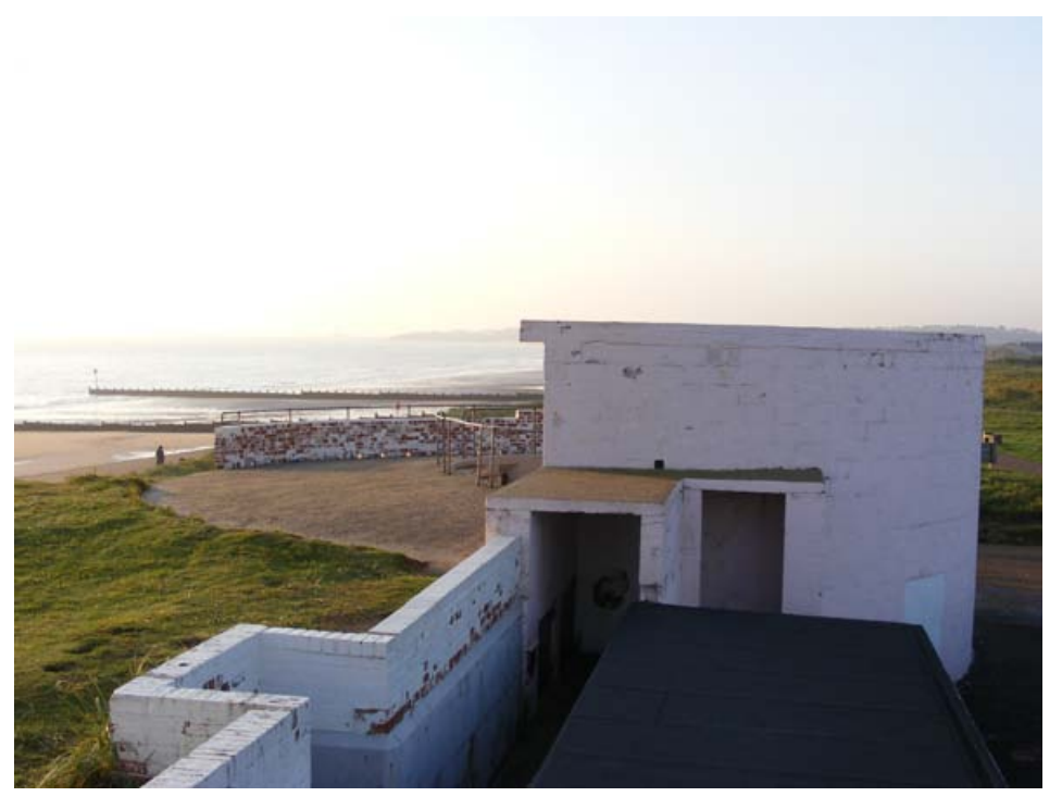
Blyth Battery

Wark Local History Group received funding to restore Victorian reading rooms at Wark Town Hall with volunteers cataloguing the original books from the library. Similarly, Glendale Churches Heritage Group, a subgroup of Glendale Alive Partnership, aims to develop heritage tourism around the ten ancient churches within the Glendale Rural Deanery. including St Gregory's at Kirknewton and St Michael's at Ingram, both situated within Northumberland National Park. NNPA has installed counters to help the group understand visitor patterns and continue to assist with the development of new interpretive media, guides and family history resources.